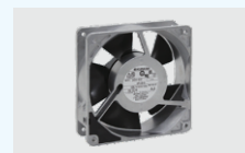
Rapid cooling fan